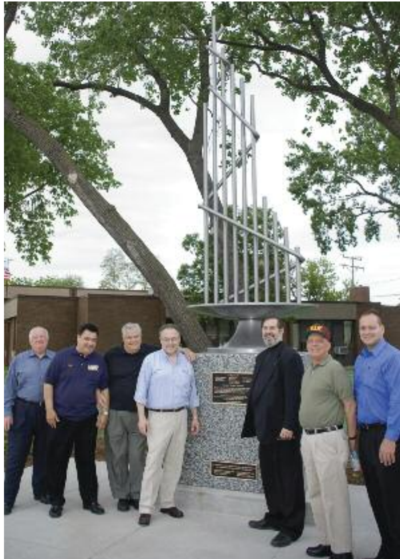
Pictured above is the Memorial Day Monument across the street from where the Memorial Day Massacre took place in 1937.