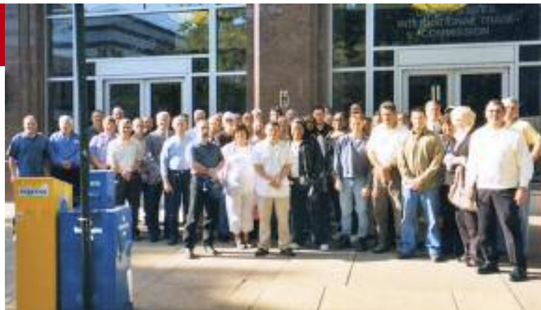
SOAR and USW members in front of the United States International Trade Commission Building in Washington, D.C.

SOAR members along with active Steelworkers attended the International Trade Commission (ITC) hearing. The ITC ruled unanimously that the Chinese government was unfairly subsidizing the U.S. steel pipe industry and that the Chinese were selling their steel pipe in the United States far below their production costs, in a practice known