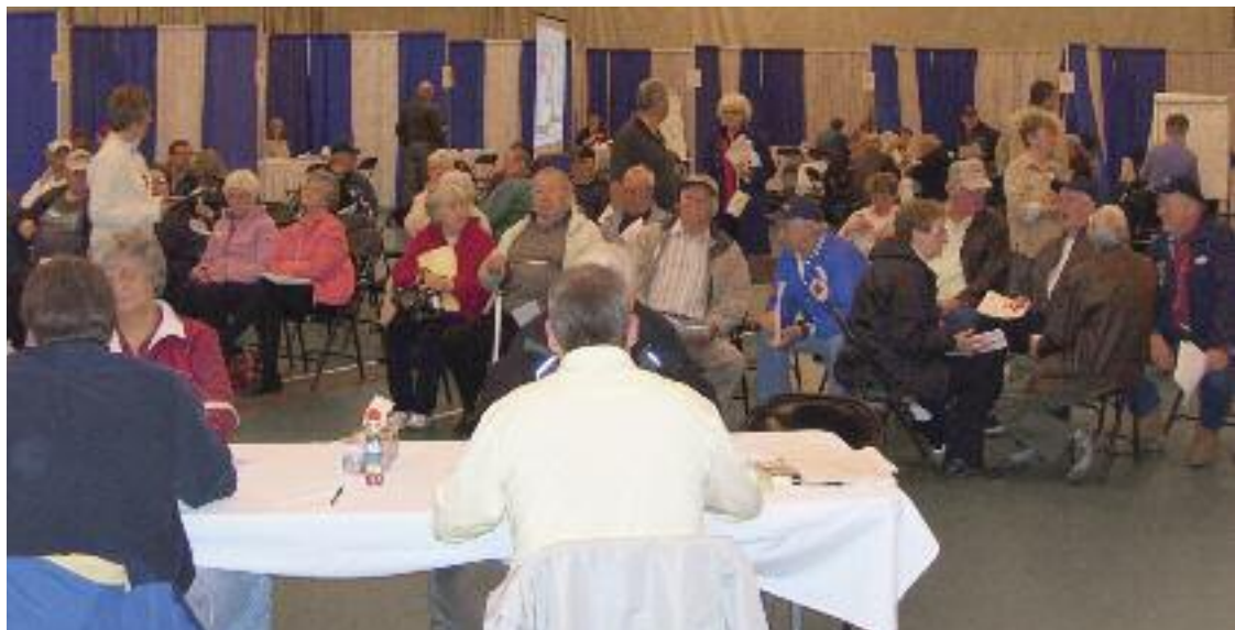
More than 550 current and retired Steelworkers took part in an Occupational Health Clinic sponsored by USW Local 2251.

“I am hoping to at least get some confirmation that all I’ve gone