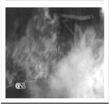
Figure 2 . July 2009 hydrofluoric acid fire, explosion and release at the CITGO Corpus Christi Refinery.