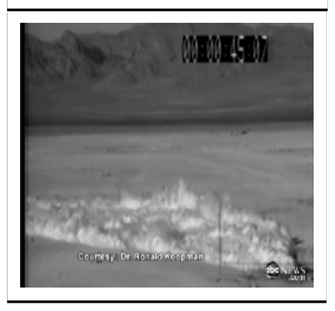
Figure 1 . August 1986, an industry-sponsored controlled release of anhydrous hydrofluoric acid at a remote area of the Nevada Test Site. The seven minute test release created a hydrofluoric acid cloud over 10 feet high and visible from as far as ¾ of a mile.